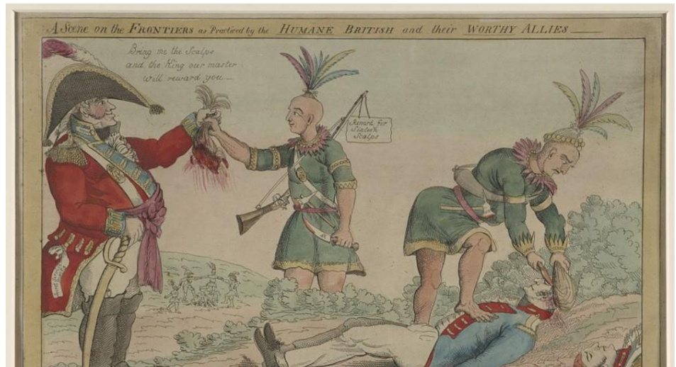
As pictured in this 1812 political cartoon published in Philadelphia, Americans lambasted the British and their native allies for what they considered "savage" offenses during war, though Americans too were engaging in such heinous acts. William Charles, A scene on the frontiers as practiced by the "humane" British and their "worthy" allies, Philadelphia, 1812.

With Britain's main naval fleet fighting in the Napoleonic Wars, smaller ships and armaments stationed in North America were generally no match for their American counterparts. Early on, Americans humiliated the British in single ship battles. In retaliation, Captain Philip Broke of the HMS Shannon attacked the USS Chesapeake , captained by James Lawrence, on June 1, 1813. Within six minutes, the Chesapeake was