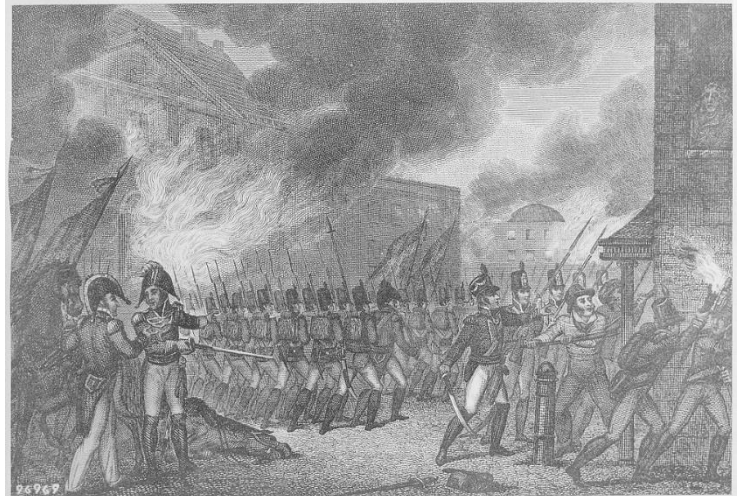
Contemplating the possibility of secession over the War of 1812 (fueled in large part by the economic interests of New England merchants), the Hartford Convention posed the possibility of disaster for the still-young United States. England, represented by the figure John Bull on the right side, is shown in this political cartoon with arms open to accept New England back into its empire. William Charles Jr., The Hartford Convention or Leap No Leap.

Two and a half months later the USS Constitution squared off with the HMS Guerriere . As the Guerriere tried to outmaneuver the Americans, the Constitution pulled along broadside and began hammering the British frigate. The Guerriere returned fire, but as one sailor observed, the cannonballs simply bounced off the Constitution's thick hull. "Huzzah! Her sides are made of iron!" shouted the sailor, and henceforth, the Constitution became known as "Old Ironsides." In less than thirty-five minutes, the Guerriere was so badly damaged that it was set aflame rather than taken as a prize.